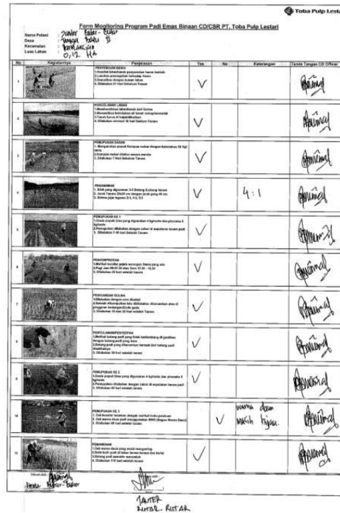
Figure 1 Jajar Legowo Program Monitoring Form

The company awakens the economy by adding new insights and providing seeds for the community to work on. the community can add new jobs with innovative assistance and also of course the opening of job vacancies in this company. The programs in the economic field provided create a new and more work for the community.