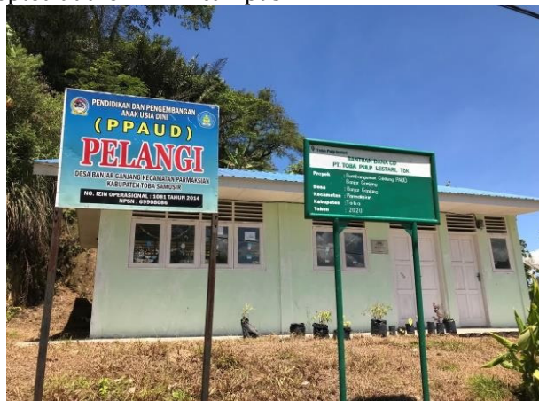
Figure 4 CD TPL Assistance for the Construction of PAUD Buildings

The TPL company is here to provide assistance programs that can increase the spirit of teaching and learning activities, such as reading cottages in several schools, building early childhood education, building study rooms, providing table chairs and providing play equipment for PAUD children. Not only that, the company conducts a scholarship program for students who are accepted at the IT DEL campus.