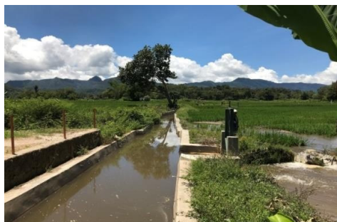
Figure 2 Assistance for the Development of Drainage for the Village of Tangga Batu II

The company is very concerned about the infrastructure in Parmaksian District. the company's programs in the field of social investment aim to create good infrastructure in the community so that it can facilitate community activities or activities in Parmaksian District. In the many programs carried out by the company for Parmaksian District, including the company building drainage for irrigation, building a village head's office to facilitate government activities, paving roads, building bridges, building concrete rebates, construction and many more.