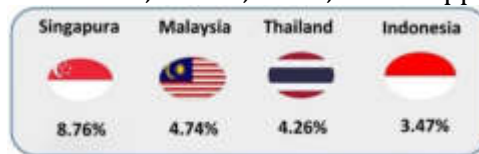
Figure 1. Indonesian Entrepreneurship Ratio Compared to Neighboring Countries

Indonesia obtained a score of 38.61 and is in the 67th position in the world in this ranking. The ranking of entrepreneurs in Indonesia is still relatively low compared to other countries, based on the Global Entrepreneurship Index (GEI) Indonesia is still ranked 75th out of 137 countries. And in the ranking of Asian countries, Indonesia is ranked 9th in a row after Singapore, Japan, Malaysia, South Korea, Brunei, China, the Philippines and Thailand.