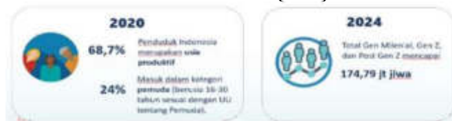
Figure 2 Indonesian Demographic Conditions

In a country that has a good and developed economy, at least 4% of its citizens are entrepreneurs, while Indonesia only has 3.47% (World Bank, 2021). Indonesia has a great opportunity to boost economic growth through creating new entrepreneurs, increasing business scale, increasing work/entrepreneurship skills and competencies for the community, and creating jobs. Indonesia's young population has the potential to become entrepreneurs and workers who have creative talents and are able to drive economic, socio-cultural dynamics in both urban and rural areas. One of the factors that supports the role of MSMEs in the national economy is Indonesia's demographic bonus. And now Indonesia is entering a phase of demographic bonus. Based on BPS data, National Economy (Susenas) in 2018, Indonesia is home to 63.82 million young people. This proportion constitutes a quarter of the total population or 24.15% of a total of around 265 million people in Indonesia which, when combined with 64.19 million units of Micro, Small and Medium Enterprises, makes a major contribution to the National Gross Domestic Product (GDP).